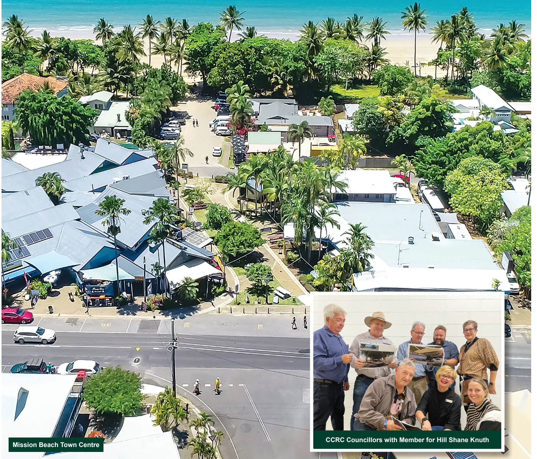
Mission Beach Town Centre