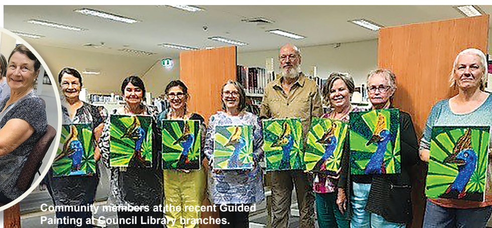
Community members at the recent Guided Painting at Council Library branches.