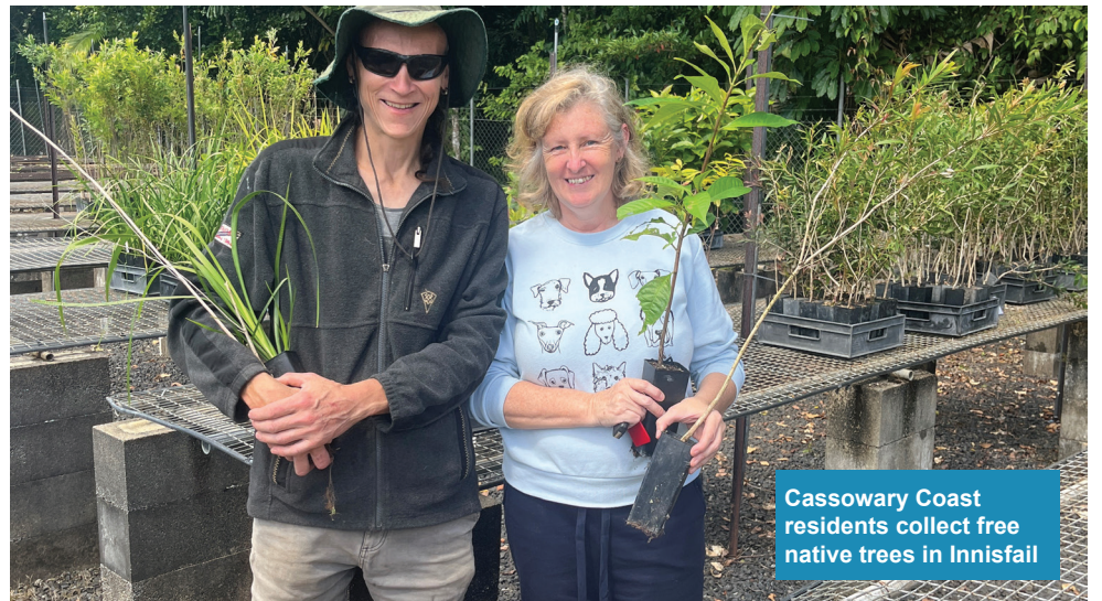
Cassowary Coast residents collect free native trees in Innisfail

Over the past two weeks at both Innisfail and Tully Council Nurseries, residents have been encouraged to build a greener future with Council's annual Native Tree Giveaway.